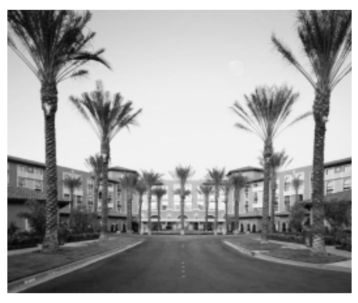
January 24-27, 2001